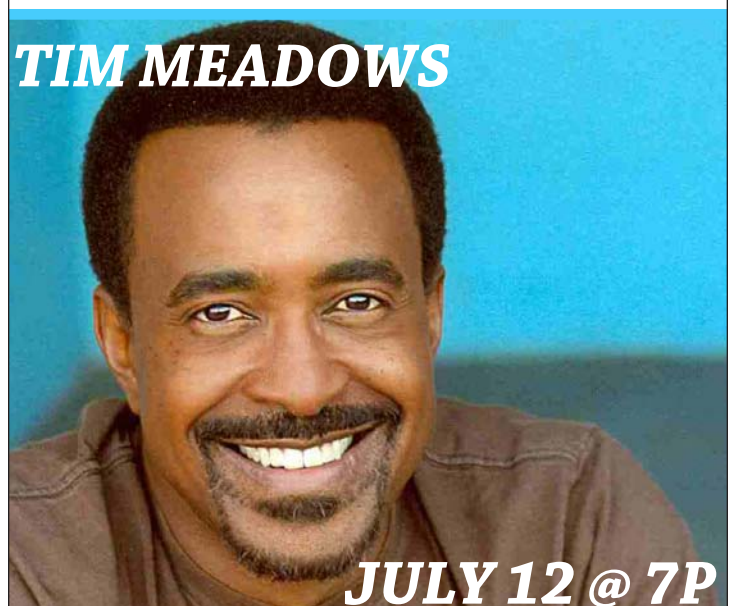
TIM MEADOWS JULY 12 @ 7P