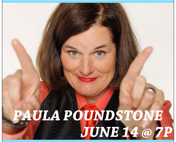
PAULA POUNDSTONE JUNE 14 @ 7P