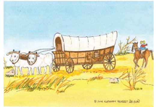
This is one of 14 images created for the special Sesquicentennial edition of QB. This image is for the chapter about Barrington's early settlement.